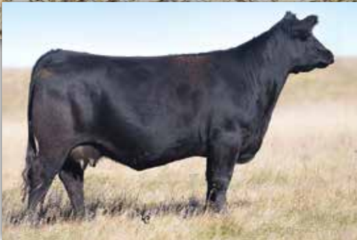
A27 // DAM TO LOT 10