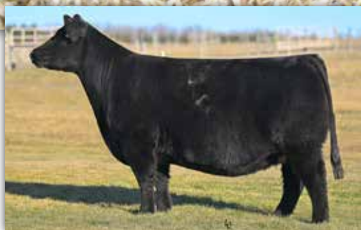
G04 // DAM OF LOT 49