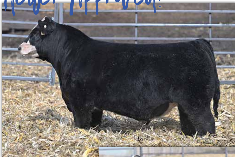
LOT 44 // C29