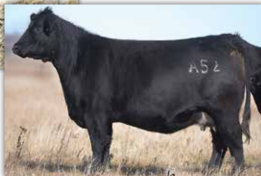
A52 // GRANDAM TO LOT 27

BREED // MAINETAINER 5/16 AN 11/16 REGISTRATION // PENDING