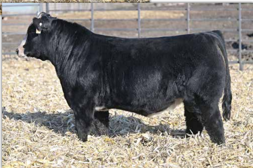
LOT 45 // F37