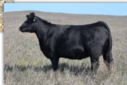
E48 // GRAND DAM TO LOT 43

We've always had great luck when using a Bush Angus bull, Wing Man is no exception. He's notably square and wide at the ground, large footed, wide backed, robust middled, and powerful hipped. Power Angus+ bull to add the pounds.