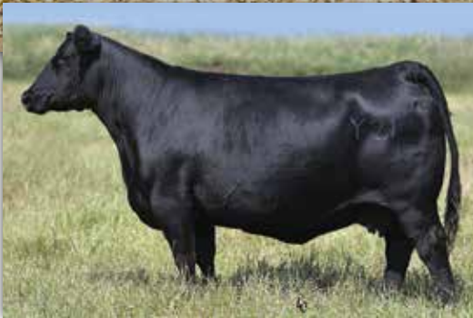
Y21 // DAM TO LOT 12