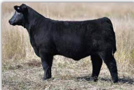
E49 // MATERNAL SIB TO LOT 22