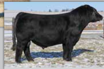
SWEET WILLIE SIRE TO LOT 74A EMBRYOS