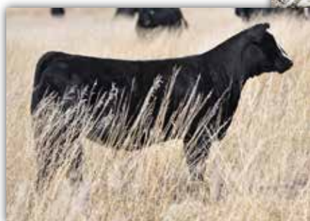
Z47// MATERNAL SISTER TO LOT 54