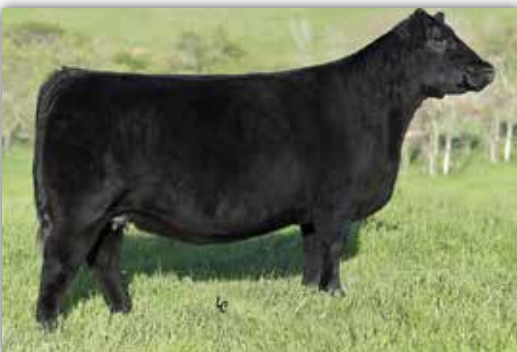
OOH LA LA // GRAND DAM TO LOT 59