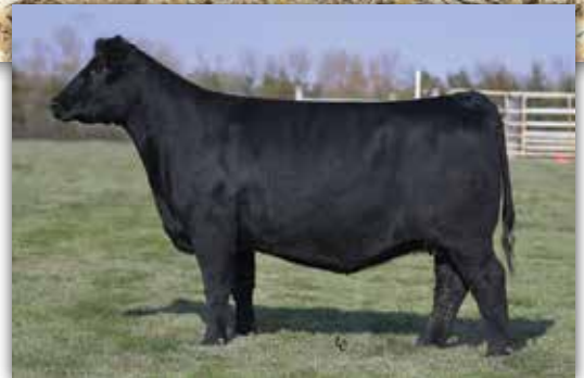
E01 // GRAND DAM OF LOT 58

If you fancy some chrome, your bull search is over! This bull would be ideal for pairing with Angus cows. He is smooth in his muscle shape and design while remaining exceptional in his joints and to top it off, his cow family is the great Ooh La La and Chanel, backed by 3 donors.