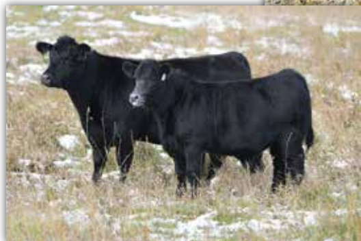
D50 & MATERNAL SIB TO LOT 36