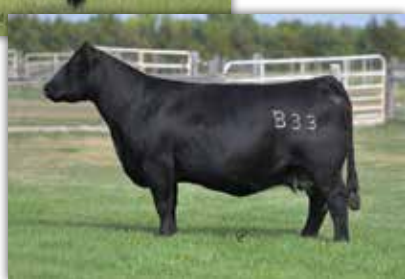
B33 // GRAND DAM

BREED // MAINTAINER 3/8 AN 5/8 REGISTRATION // PENDING