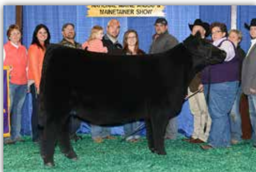
OOH LA LA // GRAND DAM TO LOT 23