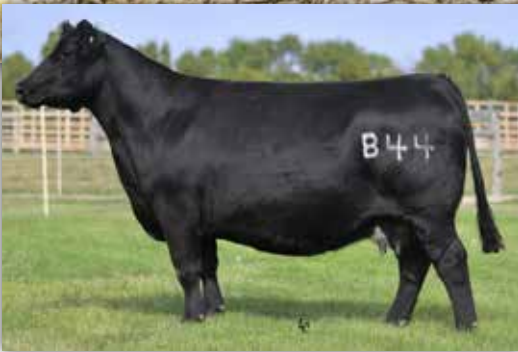
B44 // DAM OF LOT 61