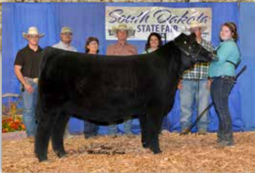
C11// GRAND DAM TO LOT 55