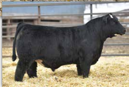
FULL SIB TO LOT 65

This is E38's 4th Bankroll bull in a row, all in the bull sale, averaging $5750. This one could be the best one yet! Bankroll has been a huge hit at our place, we've used 100 units the last 3 years, keeping several of the daughters. This guys extra power comes from the cow, Net Worth and Twister are Angus with some umph!