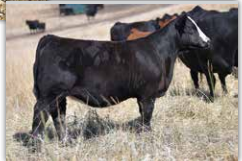
Z44 // Z44 MATERNAL SIB TO J07 DAM OF LOT 53

BREED // MAINETAINER 1/4 AN 11/16 SM 1/16 REGISTRATION // PENDING