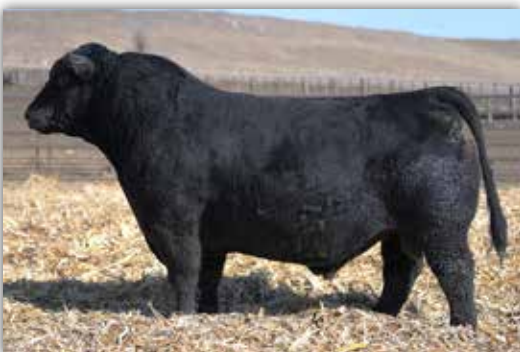
MILLION $ SECRET // MATERNAL SIB TO LOT 12