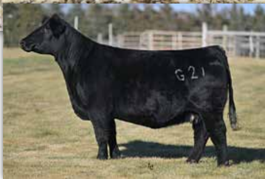
G21 // DAM TO LOT 71