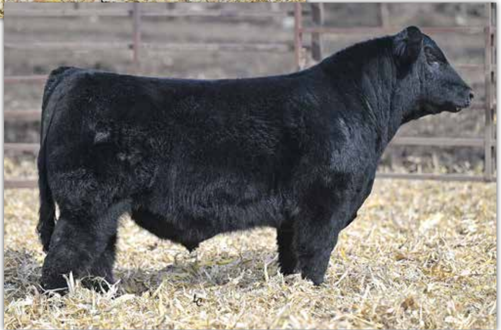
LOT 48 // G41