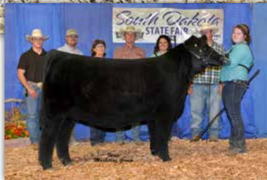
C11 // DAM TO LOT 62

BREED // SIMMENTAL 1/2 AN 3/8 MA 1/8 REGISTRATION // PENDING