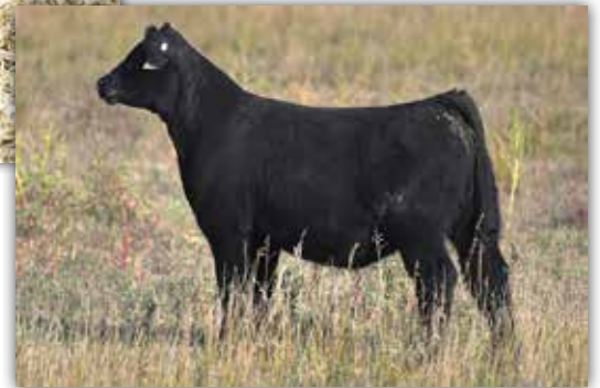
E56 // $16,000 HEIFER FROM OUR 2023 PASTURE SALE

Omaha was our choice for a Gold Standard son from the G-. This bulls extra shot of muscle makes him a stand out. Looking for a bull to tone down your cows, add the belly and more performance than a heifer bull, this is your herd sire.