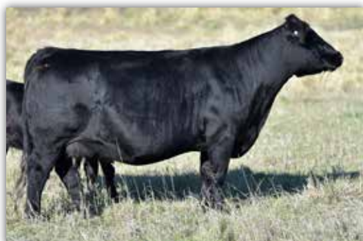
Z20 DAM TO LOT 64

BREED // SIMMENTAL 3/4 1/4 AN REGISTRATION // 4335232