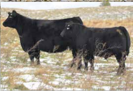
C54 // DAM TO LOT 46 WITH A MATERNAL SIB