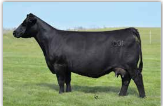
C01 // GREAT GRAND DAM TO LOT 58