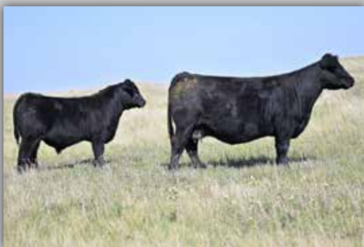
D02 // DAM TO LOT 74 74A EMBRYOS