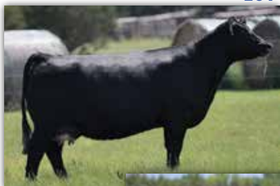
F06 // DAM TO LOT 32 & 33