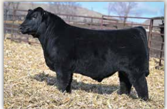
E31 // HE SELLS AS LOT 30

A phenotype standout of his class with an abundance of performance. To date, E31 has produced our Herd Sire, Slim Fit and two remarkable daughters. A massive-bodied female with a near perfect udder compliments the bull's phenotype to create a most exciting prospect.