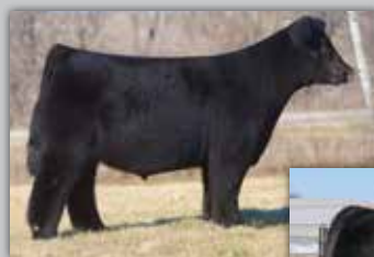
HERE I AM SIRE TO LOT 74 EMBRYOS