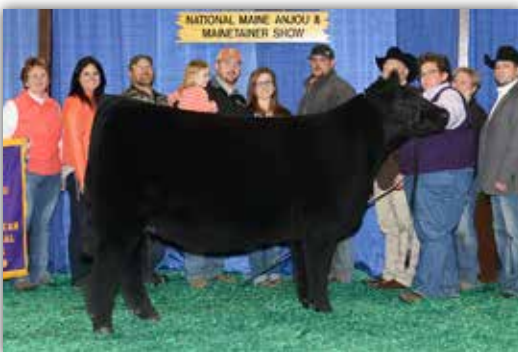
OOH LA LA // GRAND DAM TO LOT 4 & 5