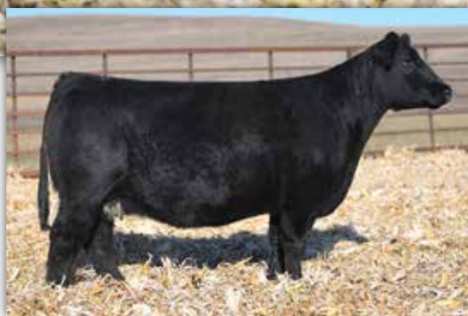
D04 // DAM TO LOT 23