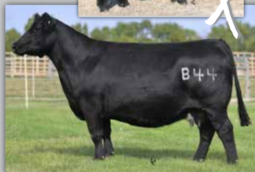
B44 // DAM TO LOT 76 EMBRYOS