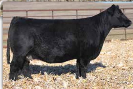
D02 // DAM TO LOT 4

This bull epitomizes the best of both the steer and maternal worlds! His lineage is rooted in two of the most successful donors at the CR ranch, then add the "King of the Ring" on top of it. Being TH and PHA clean he is a registered MaineTainer! Make more steers or keep the daughters from the powerhouse cow family for those next steer mamas. Maternal sib sells as lot 23, full sib embryos sell as lot 74.