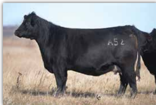
ID // GRANDAM TO LOT 39

BREED // MAINETAINER 1/4 AN 3/4 REGISTRATION // PENDING