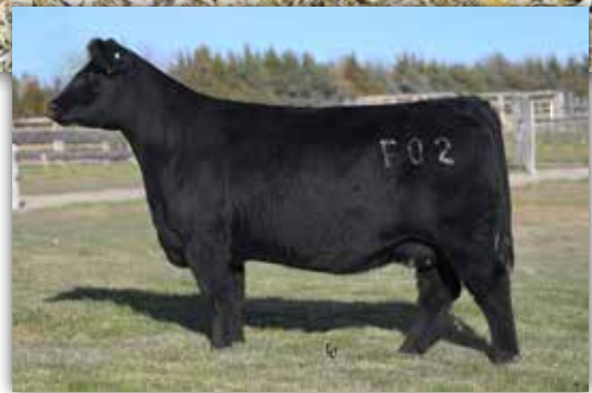
F02 // DAM OF LOT 60

Three generations of donors line the Lot 60s pedigree, Ooh La La, Dirty Dancing and F02. F02 had a $6,000 SAM heifer in the 2023 fall sale, and a $12,500 bull in 2022. Invest in something that is supported by proven assets from both sides of the genetic spectrum.