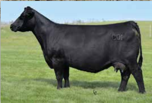
C01// DAM OF LOT 59