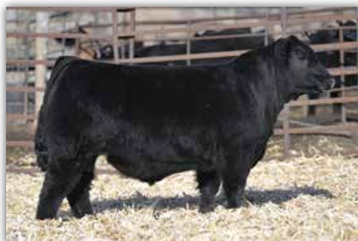
FULL SIB TO LOT 65