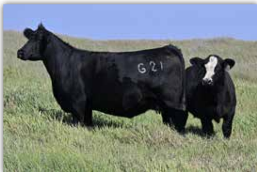
G21 // PAIR PHOTO WITH LOT 71