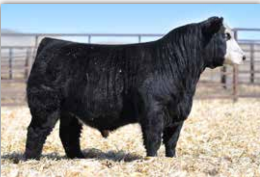
NEW MONEY // CR HERD SIRE