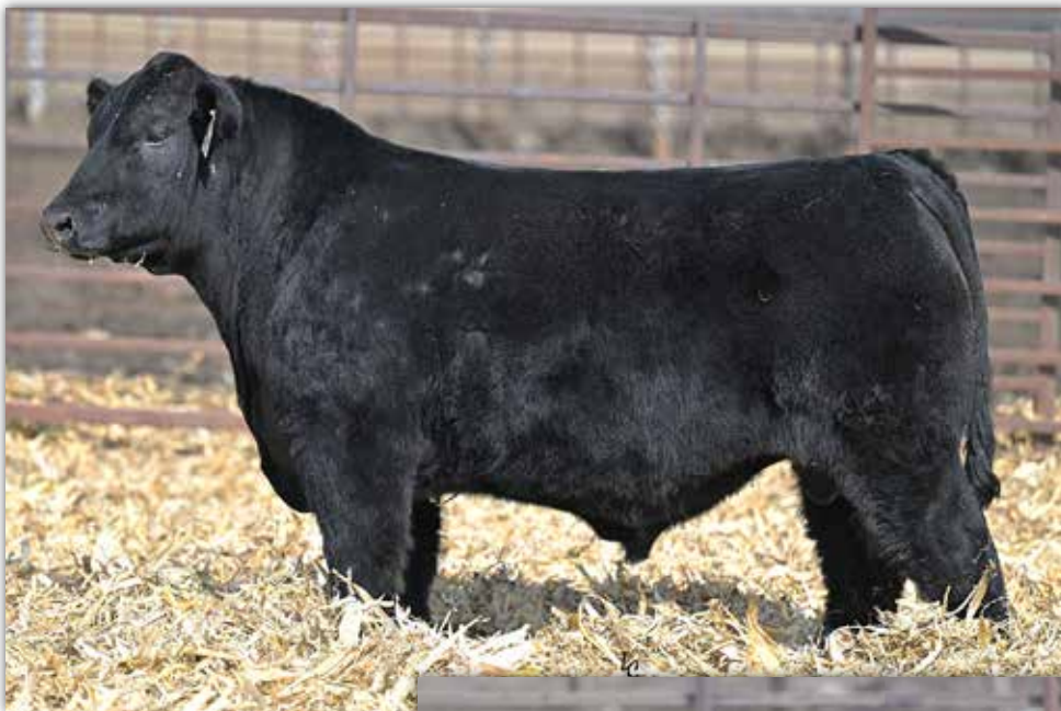
LOT 47 // G34