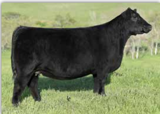
OOH LA LA // GRAND DAM OF LOT 49