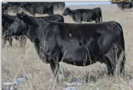
A51 // DAM TO LOT 26