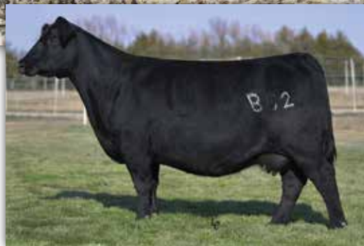
B52 // DAM TO LOT 13

BREED // HIGH MAINE 3/4 ANGUS 1/4 REGISTRATION // PENDING