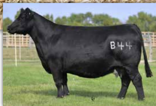
B44 // GRAND DAM TO LOT 56

BREED // MAINETAINER 3/8 SM 1/8 AN 1/2 REGISTRATION // PENDING