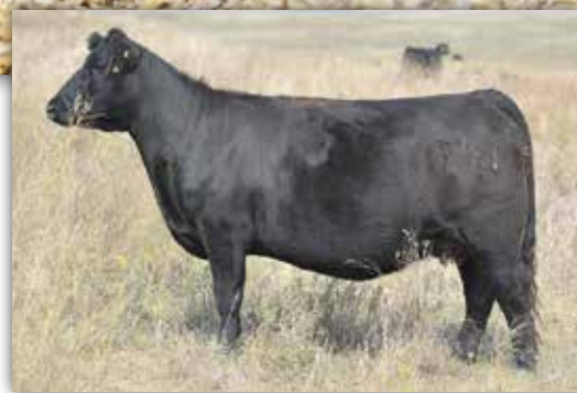
F41 // DAM TO LOT 11

BREED // MAINETAINER 3/8 AN 5/8 REGISTRATION // PENDING