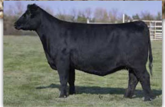
E01 // DAM TO LOT 16

Take note of the legendary Ooh La La that is in his maternal lineage, as she consistently enhances her breeding reputation with each calf crop. She embodies the type that excels in both functionality and elite appearance, bridging the gap between cattle that have performance and but also have phenotype.