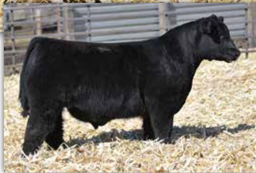
E49 // MATERNAL SIB TO LOT 22

One of my personal favorites. So good structured, loose hided, large scrotal and quality. Sweet Ride E37 continues the trajectory of Net Worth cows ascending to prominence within the program. Originating from a female consistently delivering exceptional results year after year, she has proved herself.