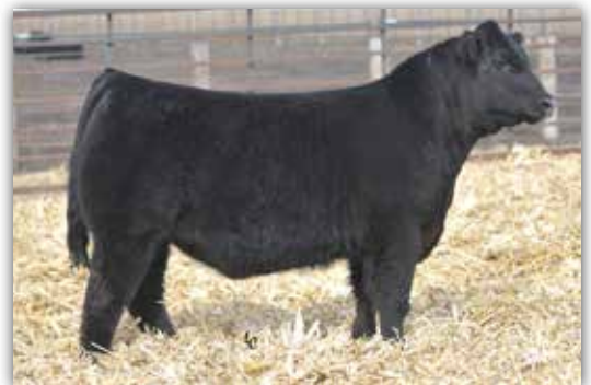
SLIM FIT// MATERNAL SIB TO LOT 30

TUESDAY, MARCH 26 \\ LIVE AUCTION - CCI.LIVE 27