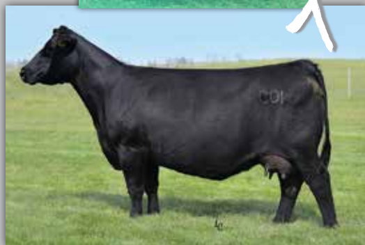
CHANEL // DAM TO LOT 75 EMBRYOS